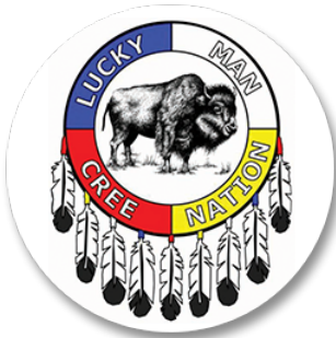
Lucky Man Cree Nation