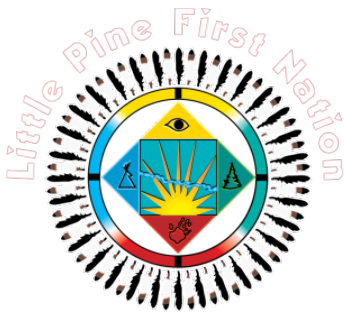
Little Pine First Nation